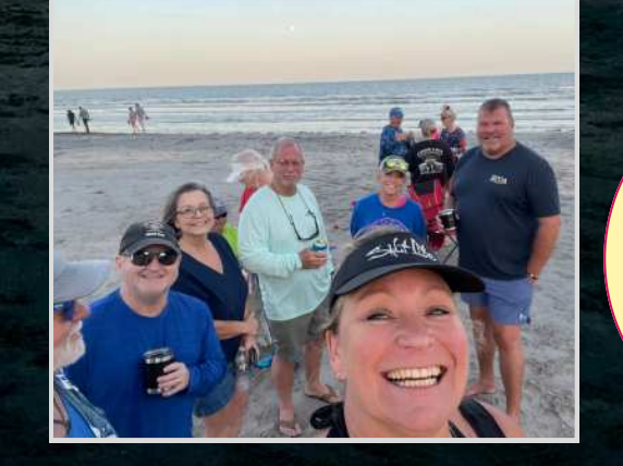
Parrot Heads out enjoying the Pink Moon